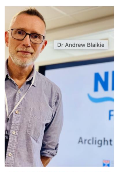
Global Citizenship Award - sponsored by Public Health Scotland

• Surgical eye camp in Sumbawanga 30.10. – 03.11.: the team of eye surgeons at Atiman Hospital in Sumbawanga operates on 55 eyes of varying degrees of difficulty under the supervision of an experienced eye surgeon